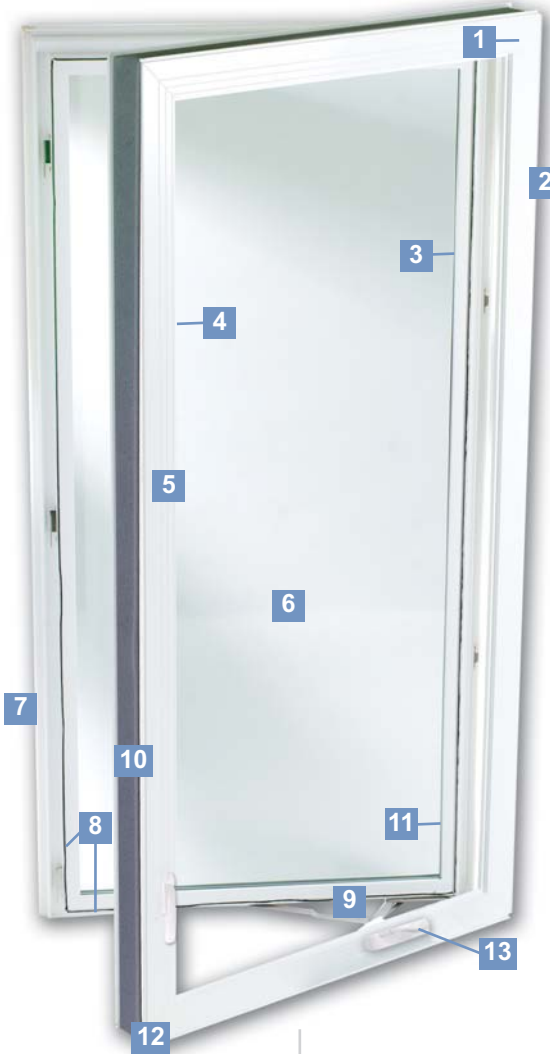
3000 Series casement shown in white.